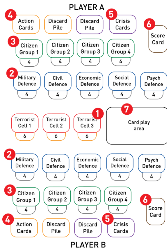
Guardians of the City Vol.2 Tabletop Layout

1 Place the 3 Terrorist Cell cards in a row, in the middle of the play area. Slide a Strength card (1-6) under each Terrorist cell such that only the number 6 on each Strength card is visible.